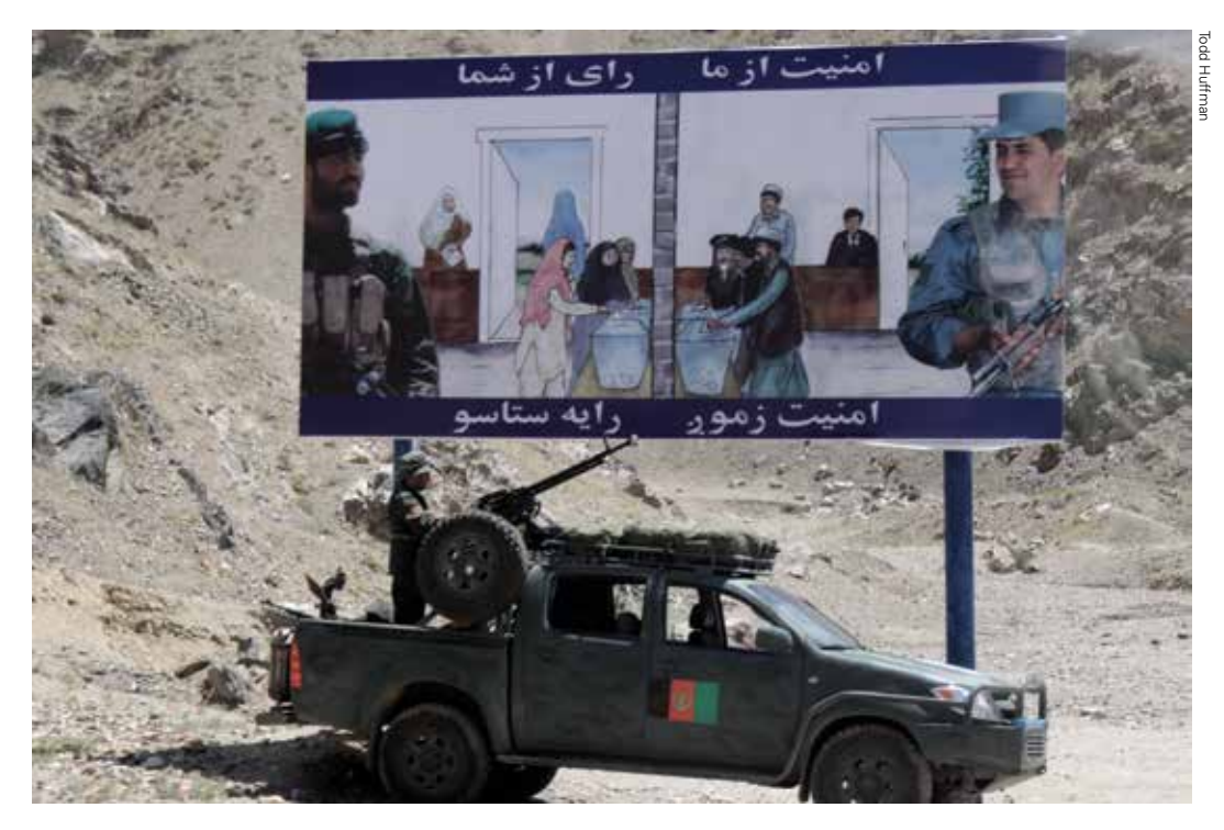
The 'Go Vote' posters have a distinct message -- armed guards are prominent on either side and in this case there's a real one at the base.

The scale of corruption in Afghanistan is closely linked to the political settlement that has occurred in the country as CPNs, which are often regionally and ethnically aligned, pursue political as well as criminal agendas. The networks with the greatest degree of influence in the Afghan government and its critical institutions have their roots in the mujahideen commander's networks and political parties that emerged in the conflicts of the 1980s and 1990s-the Soviet-Afghan war, the subsequent civil war, and the anti-Taliban resistance. With the Bonn Agreement in 2001, many of the figures in these networks acquired senior positions within Afghanistan's newly formed national government. These figures, in turn,