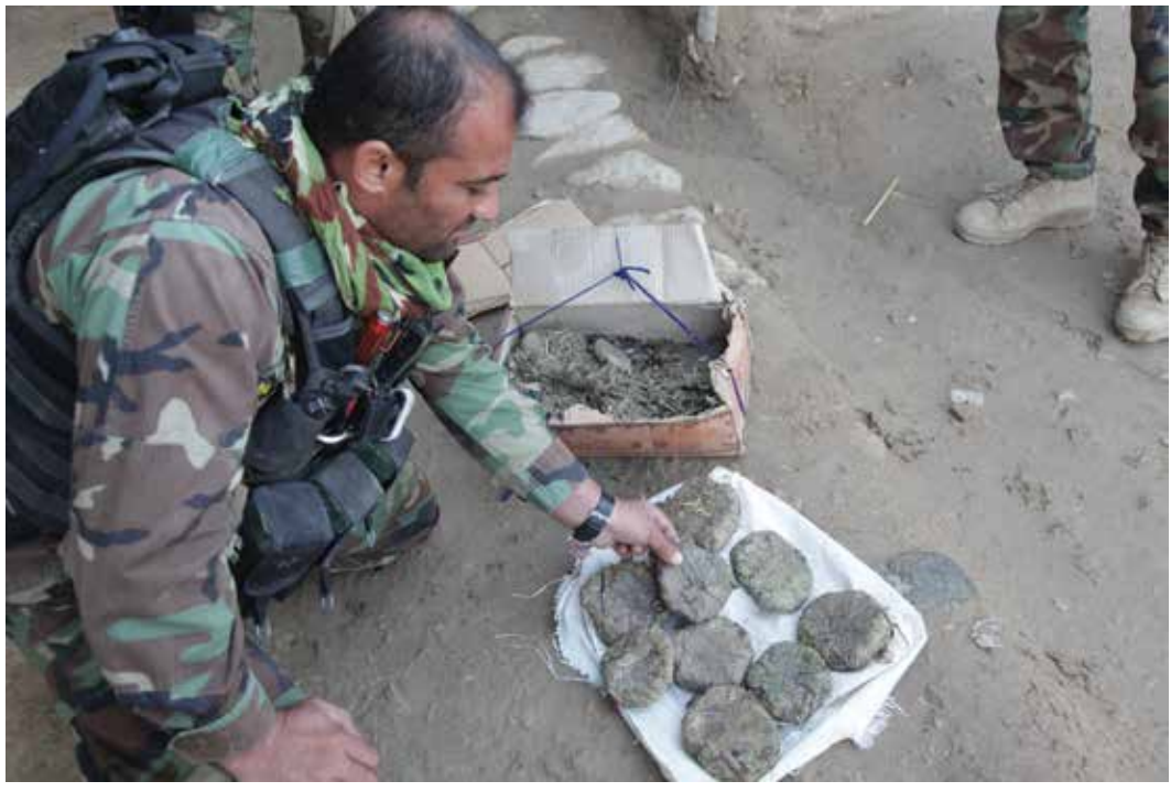
The first sergeant of the Afghan National Army (ANA) 1<sup>st</sup> Special Operations Kandak examines illegal drugs found during the search of a compound Nov. 11, 2013, in Achin district, Nangarhar province Afghanistan.

The problem of corruption is particularly dangerous within the security ministries and the